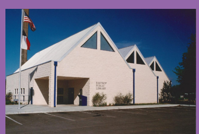
1100 Church Steet Current location, but pre-expansion